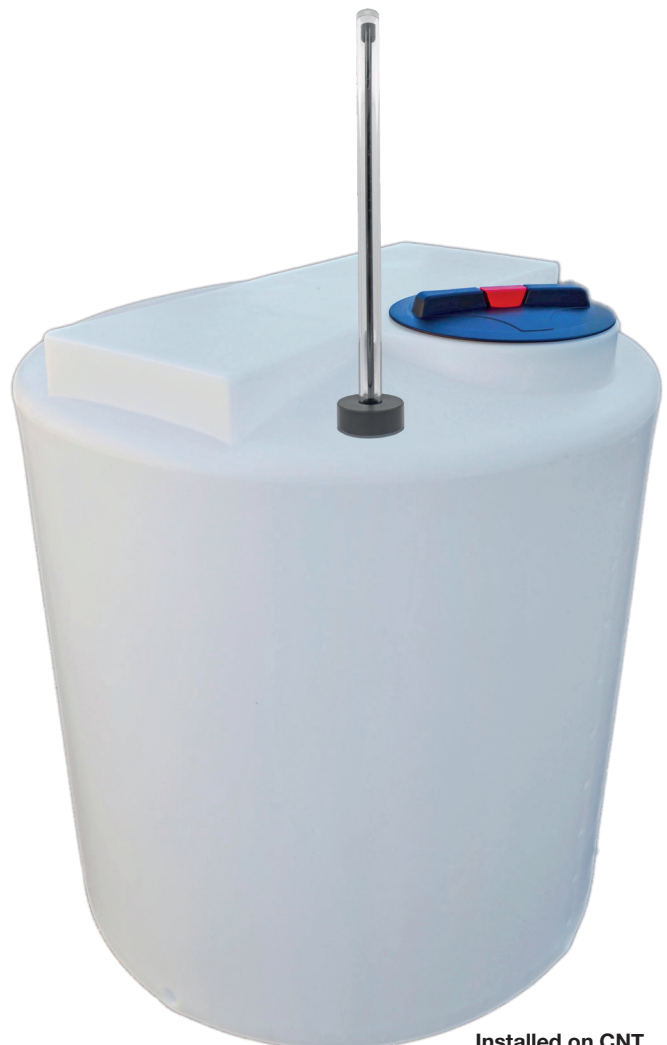
Installed on CNT